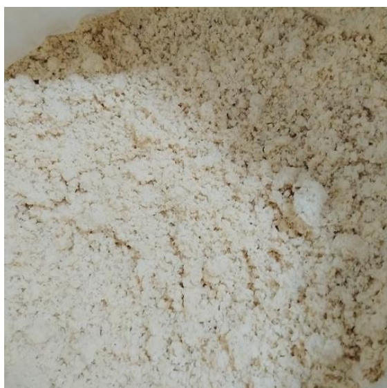
Fig. 9. Tofu dregs 8

material. The protein extraction process involves preparing dry tofu pulp, adding water (1:2), and using a strong base (2 N NaOH) for extraction for 1 hour. The extracted protein is then filtered twice to separate it from the residue.