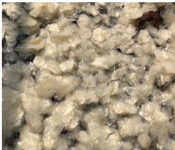
Fig. 13. Fish Scales 12

washed, and dried. Chitosan preparation involves breaking the acetyl group in the chitin extract by deacetylation. Chitin is dissolved in 50% NaOH for 1 hour at 100°C (1:10, m/v). The resulting mixture is filtered, washed, and dried [25].