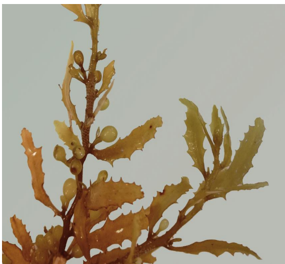
Fig. 10. Sargassum sp. 9

resulting alginate fibers are filtered, washed with 1% NaOH until neutral pH, and then immersed in 3 liters of isopropyl alcohol (1:3 v/v) to create alginate fibers, which are then sun-dried and blended into powder [21].