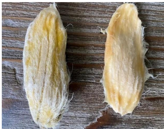
Fig. 4. Mango Seeds 4

separated and subjected to drying in an oven set at 30°C for a duration of 12 hours [16]. This comprehensive procedure ensures the efficient extraction of starch from mango seeds, establishing a viable source for the production of bioplastics.