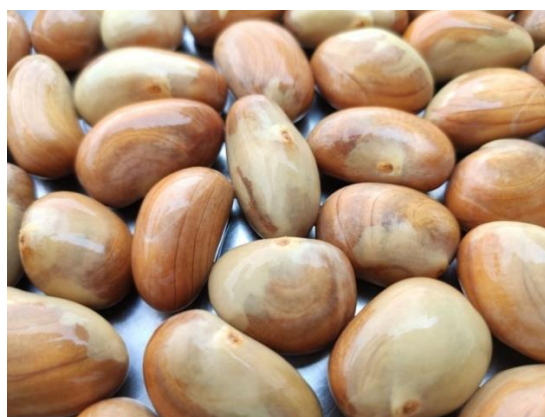
Fig. 3. Jackfruit Seeds 3