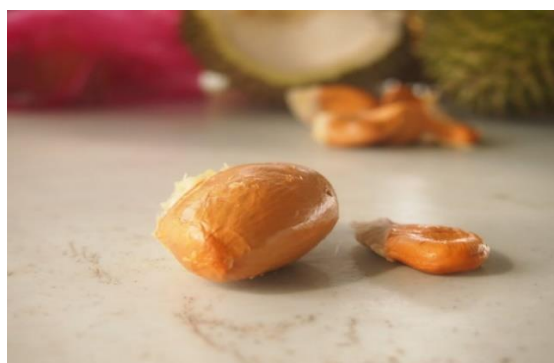
Fig. 5. Durian Seeds 5