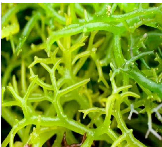
Fig. 11. Kappaphycus alvarezii 10

Carrageenan extraction from K. alvarezii involves soaking 50 g of dry seaweed in 350 ml of distilled water for 30 minutes, followed by filtration and soaking in 5% KOH for 24 hours. After thorough washing, the seaweed is boiled in 2 liters of distilled water at 90°C for 3 hours. The extraction results are filtered, poured into isopropyl alcohol (1:3 v/v) to form fibers, then