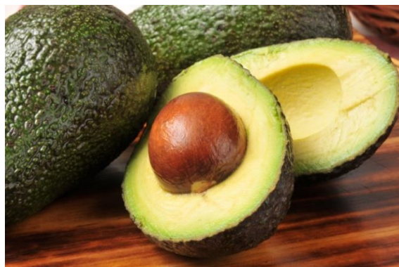
Fig. 2. Avocado Seeds 2

squeezing, and allowing the squeezed material to stand for 24 hours to obtain starch sediment, which is then sun-dried [4].