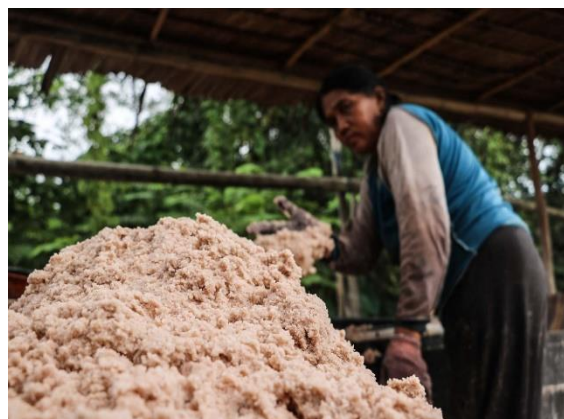
Fig. 7. Sago dregs 7

The results were weighed and put in a container [19].