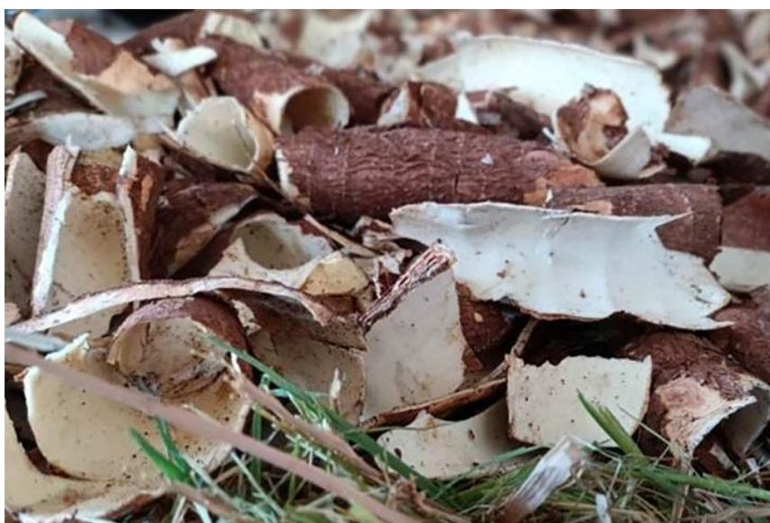
Fig. 1. Cassava peel 1

In a similar vein, another study [11] adopted a comparable process for cassava peel starch preparation. Beginning with the washing of cassava peels, they were crushed with water (1:4) and blended to produce wet cassava peel pulp. The pulp underwent squeezing and filtering with a cloth, and the resulting liquid, starch water, was left to settle for 12 hours to obtain starch sediment. After separation from the water, the starch sediment was dried to achieve a moisture content of 11%. The dried starch was then sieved through a 60-mesh sieve to obtain fine cassava peel starch.