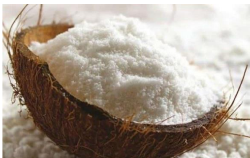
Fig. 6. Grated coconut pulp 6

layers, they are separated using a separating funnel. The galactomannan obtained is dried with an oven at 60°C. The dried galactomannan is weighed to determine the optimal mesh size.