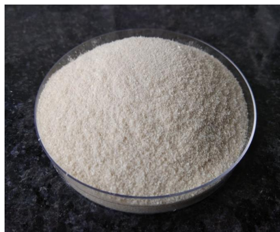
Fig. 12. Chitosan 11

Chitosan (Fig. 12), a biopolymer derived from the deacetylation process of chitin, is typically extracted from crustacean shells, such as those of crabs and shrimps, as well as from the cuticles of insects, fungi, and even fish scales [23]. Functioning as a reinforcement, chitosan plays a crucial role in enhancing tensile strength and elongation at break [24]. Its primary application lies in being an additive in bioplastic production, where it imparts several improvements. The hydrophobic, non-toxic, and biodegradable properties of chitosan contribute to the development of robust bioplastics with heightened water resistance. The inclusion of chitosan also augments the number of hydrogen bonds within the bioplastics, providing additional support to their structural integrity [23].